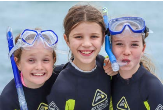
Future generations are relying on us.