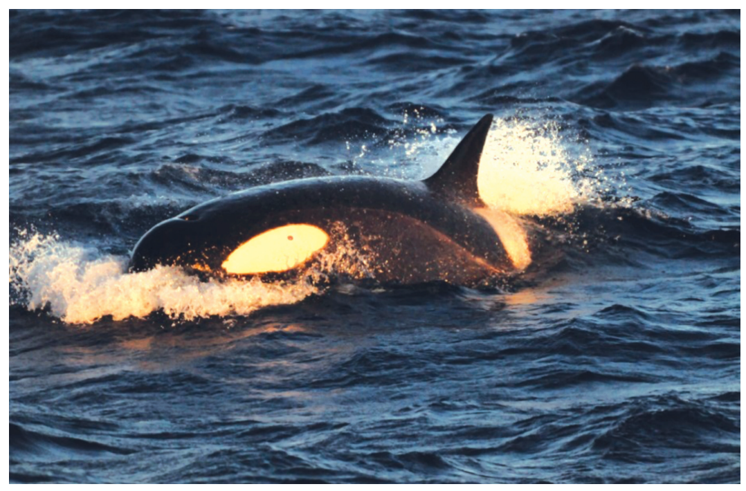
Figure 5. Type B sighting, Western Australia