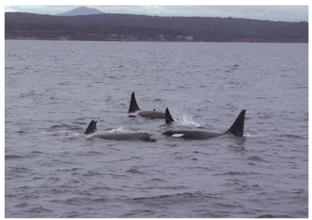
Figure 8. Type C sighting, Eden, New South Wales, 5 May 2008