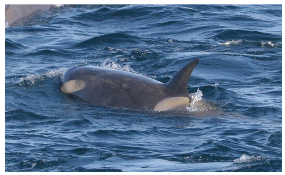
Figure 2. Possible new killer whale ecotype recorded in East Antarctic waters

patterns and habitat use. It has been suggested these variations may be correlated to foraging behavior. A single satellite tagged Type B killer whale moved sporadically at greater distances than the tagged Type C killer whales, which tended to be more localized (Andrews et al., 2008). Similar movement patterns have been documented in mammal and fish-eating killer whales in the Northeastern Pacific (Baird, 2000).