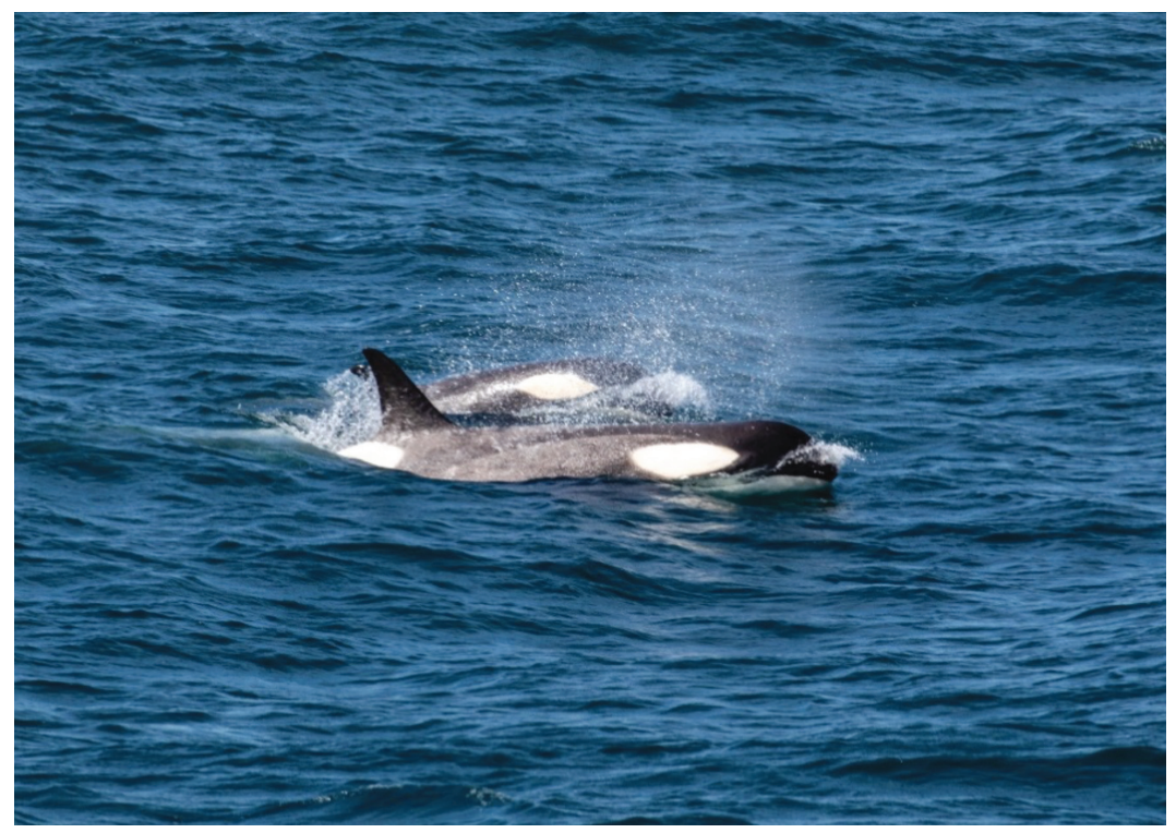
Figure 6. Type B sighting, Devonport, Tasmania