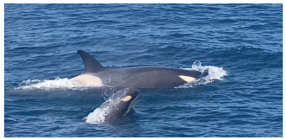
Figure 12. Type C sighting, Freycinet, Tasmania, 8 January 2021

ecotype; however, it was not adequate for inclusion in or comparison to the eastern Australian fin identification catalogue.