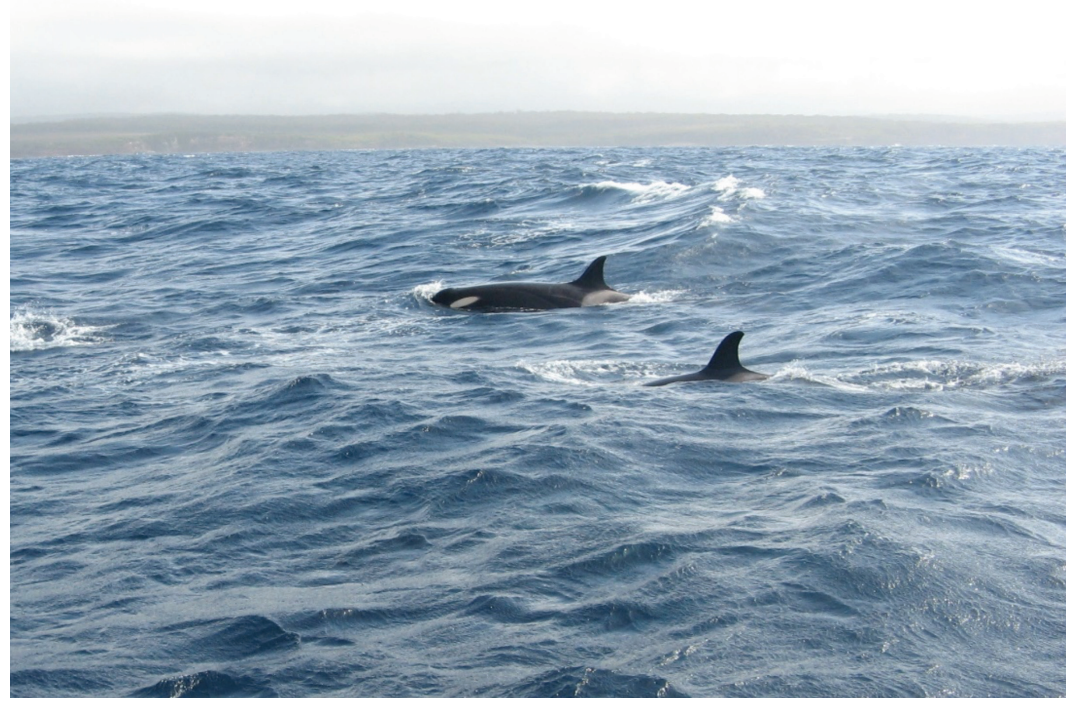
Figure 10. Type C sighting, south of Eden, New South Wales, 30 April 2014