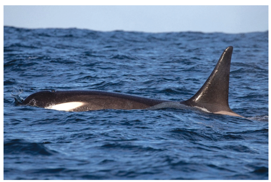
Figure 11. Type C sighting, Sydney, New South Wales, 11 July 2018