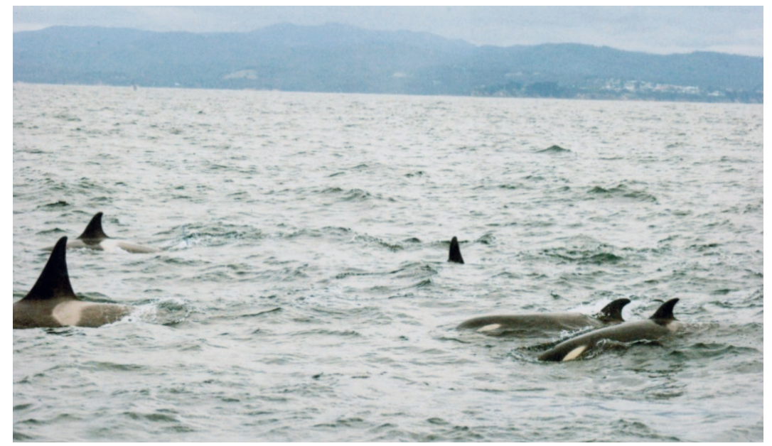
Figure 7. Type C sighting, Eden, New South Wales, 21 March 2008

Record 5 occurred on 8 January 2021 off the coast of Freycinet, eastern Tasmania (-42.251901, 148.374584; Figure 4). Group size was estimated at 12 to 16 individuals and included one adult male and at least one young calf (Figure 12). The pod maintained a steady southerly course and travel speed during the observation period. Image quality from this event was adequate for validation of