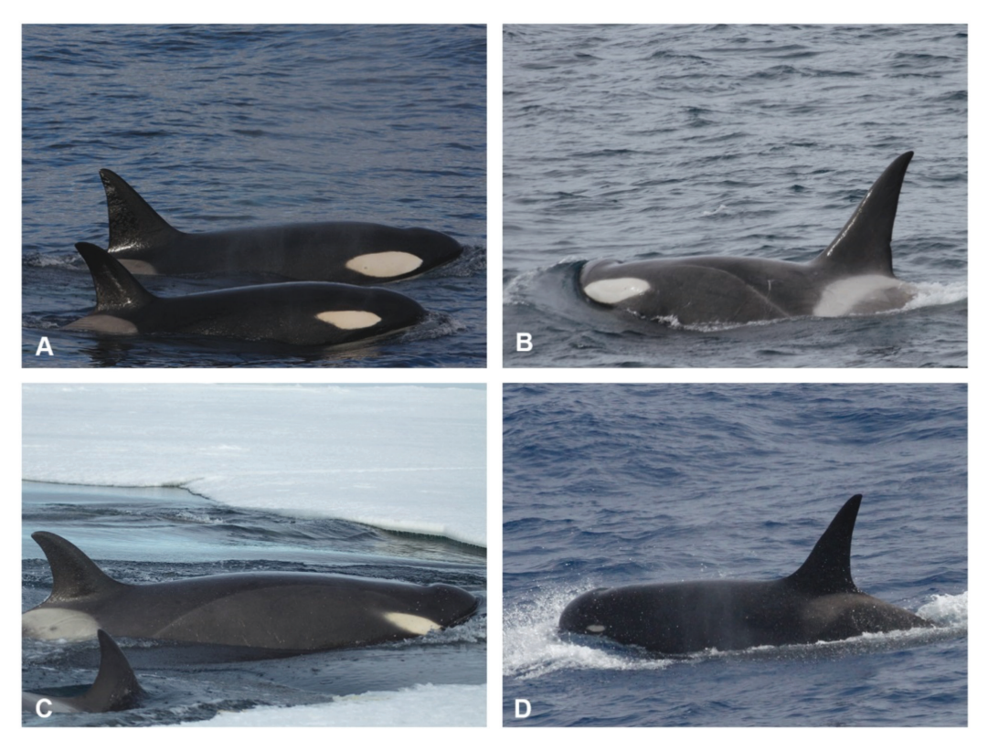
Figure 1. (A) Type A ( Photo credit: David Donnelly), (B) Type B ( Photo credit: Josh McInnes), (C) Type C ( Photo credit: Robert L. Pitman), and (D) Type D ( Photo credit: Josh McInnes) killer whales ( Orcinus orca )

Using satellite telemetry data, Andrews et al. (2008) demonstrated that the Type B and C killer whales tagged in the Ross Sea differ in movement