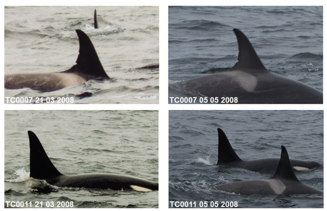
Figure 9. Example images showing confirmed matches between sightings