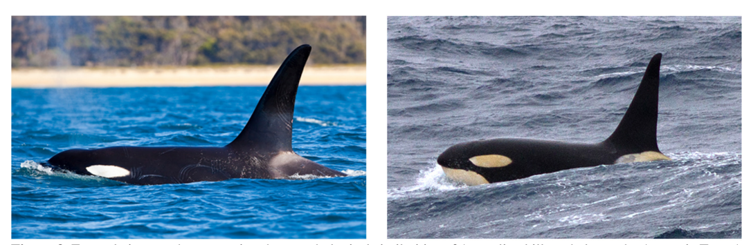
Figure 3. Example images demonstrating the morphological similarities of Australian killer whales to the Antarctic Type A form with the Australian form at left and the Antarctic Type A form at right

Type C (2008, 2014, 2018 & 2021). These records confirm that at least two of the five Antarctic ecotypes described from the Southern Hemisphere (Pitman, 2011) have now been confirmed to have occurred in Australian coastal waters (Figure 3). All sightings were opportunistic in nature, collected by scientists, whale-watching vessels, recreational fishers, and land-based observers. Each event occurred within Australian coastal waters (Figure 4).