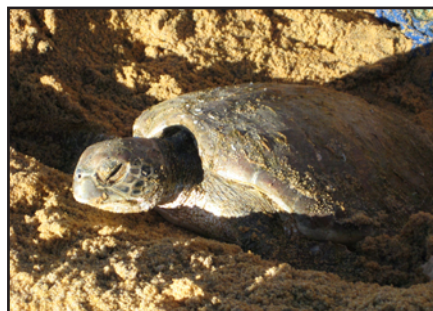
Resting near Mt Martha Life Saving Club