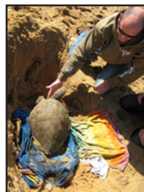
On the move