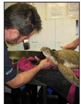
Being assessed at the Aquarium for any injuries and its general health